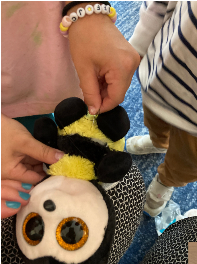
4 year old Ezra repairing a bee stuffie